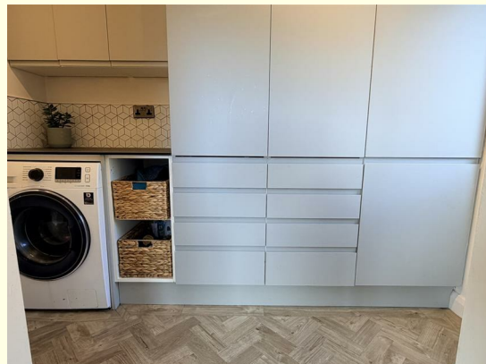
Useful separate Utility Room. Hardwood outer door with an inset obscure double