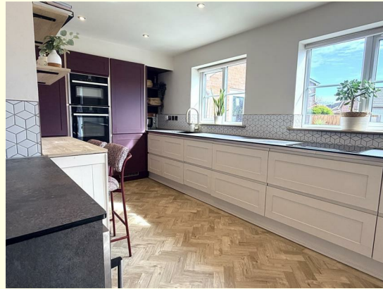
Good sized modern family Dining Kitchen installed in approx 2023. Approached from both the Hallway and Dining Room. Two UPVC double glazed windows overlook the rear gardens both with side opening lights and fitted roller blinds. Good range of eye and low level cupboards and drawers. Single drainer one and a half bowl sink unit with a centre mixer tap set in Quartz working surfaces with splash back tiling. Small fitted breakfast bar with display shelving above. Built in appliances comprise: Five ring electric induction hob. Neff electric oven and grill. Combination microwave oven. Slimline wine fridge. Neff integrated dishwasher and integrated fridge/freezer with a matching cupboard front. Additional integrated freezer. Inset ceiling spot lights. Single panel radiator. Matching Karndean flooring. Square arch leading to the Utility.