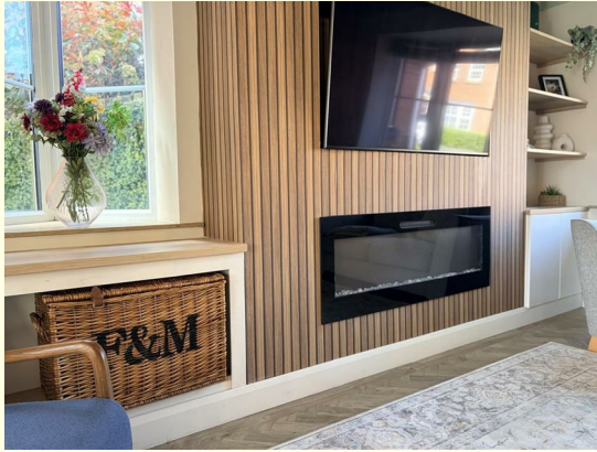
DINING ROOM 119 x 76