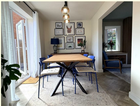
UPVC double glazed double opening French doors overlook and give direct access to the rear family garden. Feature pendant light fitting. Single panel radiator. Matching Karndean flooring. Square arch leads to the adjoining Dining Kitchen.